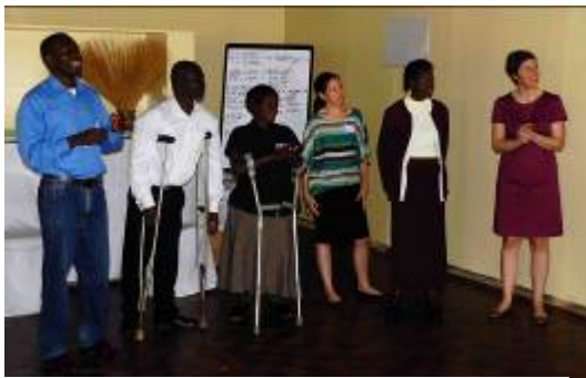
Workshop participants exchanging insights.

Stigma can and does happen anywhere. In particular, participants noted experiences of HIV and disability-related stigma taking place in the contexts of their families, communities, health clinics, workplaces, school, with the police or judicial system, and in places of worship.