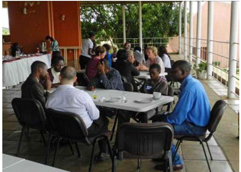
Workshop participants hard at work identifying solutions.